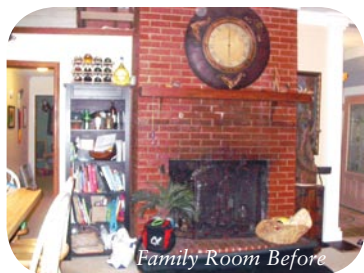
Family Room Before