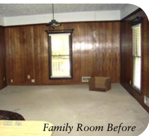
Family Room Before

Dark paneling was removed and modern accessories were added in the family room.